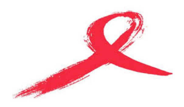
LATEST GLOBAL HIV/AIDS NEWS

EHVA regrets that it had to halt the phase I EHVA-T01 trial, scheduled to evaluate a novel therapeutic vaccine candidate in people living with HIV. Following FIT Biotech's filing for bankruptcy, the GTU-Multi-HIV B-clade DNA vaccine, developed and manufactured by FIT Biotech, was no longer available for inclusion in the vaccine regimen. The EHVA team anticipates being able to initiate a new trial with an amended protocol in due course.